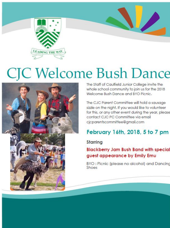
Getting ready for the bushdance.